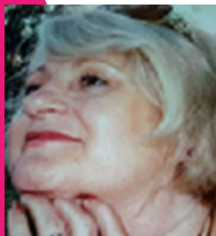
Helen Worcester Neighbourhood Watch

Susan's exceptional leadership and relationship building skills have helped the Rotary Club to play a pivotal role in community support. She shows compassion and empathy, values others' views, and actively promotes inclusion in membership, community programs and activities. Susan organised a forum on homelessness attended by over 100 stakeholders with an expert panel from five organisations. Susan has also increased club membership, focussing on diversity, helping to make Rotary Prahran "the heart of the community".